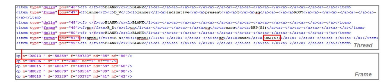
Figure 2. Rhapsodie data in Trameur base file

All linguistic annotations from the Rhapsodie sample file are preserved in the Trameur base file. These annotations can be further edited in the graphical user interface.