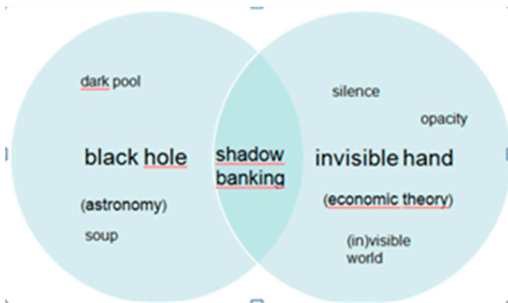
Figure 2. Shadow banking as the result of a transfer from the domain of astronomy to economy.

This mapping transfers the mixed negative and positive connotations related with exoplanets and black holes: an invisible and therefore fascinating and scary new world. Consequently, “shadow banking”, in the English context, appears as either a natural evolution of the economy or a potentially dangerous drift of capitalism towards an unknown world. To that extent, the term effectively represents the uncertainties born from the globalized economy. One might even suggest that this invisible world is related to the famous and controversial “invisible hand” of the economy [29] that is Adam Smith’s “un-observable market force that helps the demand and supply of goods in a free market to reach equilibrium automatically.” This very optimistic vision of the free market has also given rise to the much darker vision of an international and invisible financial conspiracy, a vision often tainted with anti-Semitism [30]. The Figure 2 below offers a representation of this mapping phenomenon: