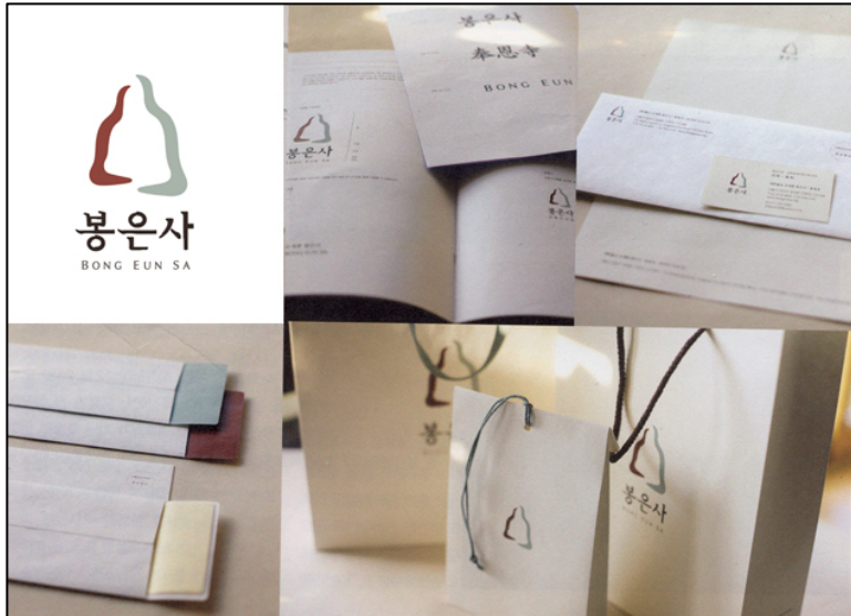
Figure 2. The new logo and examples of the graphic charter and signature established in Bongeunsa in 2008 (published on Bongeunsa's website in 2008)

In addition to this rather systematized core of discourse, Bongeunsa used the services of a design studio (Studio BAF) outside the Buddhist world in order to establish graphics standards. As for many organizations and companies, this chart was aiming at creating a thoughtful and systematized visual identity that would be rolled out to various documents and objects used or produced by the temple. This graphic system, named (directly in English) “T.I.” (Temple Identity) entails a new logo as well as a specific font and three colors listed in the international system CMYK (Cyan, Magenta, Yellow, Key Black). As stated by the artistic director of the BAF Studio, Rhee Nami, the realization of the logo and the particular attention to shapes and colors have been conducted consistently with the values and perspectives of Bongeunsa, “by combining the western language of shapes named ‘design’ with Buddhism.” The intent was to facilitate communication with both a Korean and international audience: