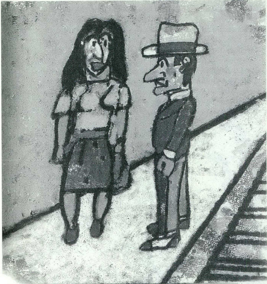
Figure 3. Antonio Seguí, “Cinco años de vida.” Image 5. Barcelona: Libros del Zorro Rojo, 2007. 29.

as a form of play (Seguí playing with the expectations of the receiver of the narrative) and a mark of his humor. Here is another example of this humor: if we interpret the fourth image as Mirta seen through the eyes of Raúl, we are led to place the subject of this perspective in an impossible location in the storyworld, namely on the railway tracks of the metro (Figure 5). 22