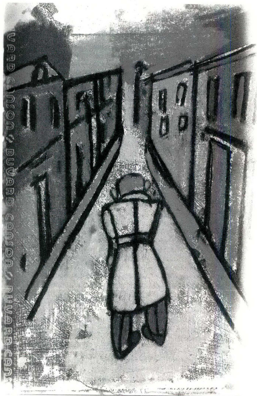
Figure 2. Antonio Seguí, "Cinco años de vida." Image 3. Barcelona: Libros del Zorro Rojo, 2007. 21.