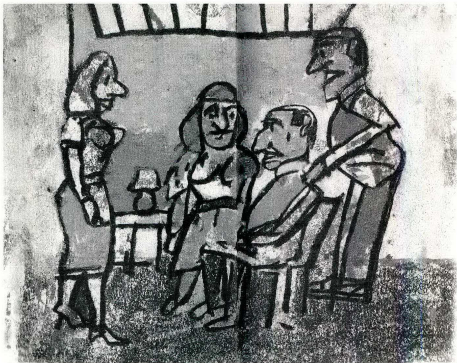
Figure 4. Antonio Seguí, "Cinco años de vida." Image 2. Barcelona: Libros del Zorro Rojo, 2007. 18–19.