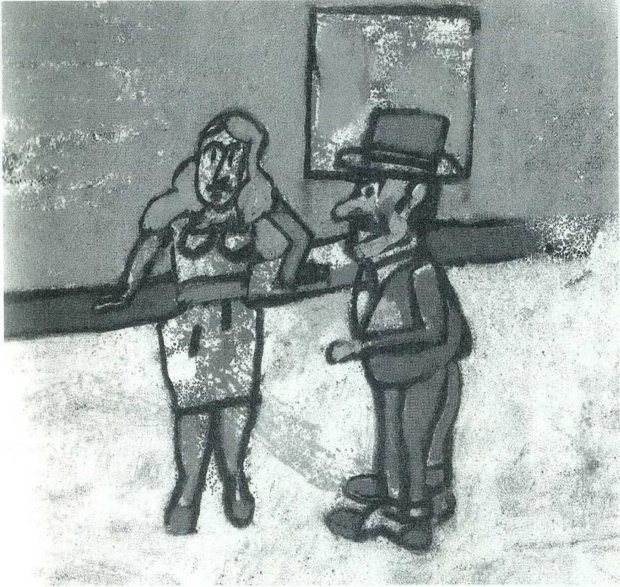
Figure 1. Antonio Seguí, “Cinco años de vida.” Image 1. Barcelona: Libros del Zorro Rojo, 2007. 16.

impermeable” (“Cinco años de vida” 20) (“It was a lot colder than four hours ago, so he [Raúl] pulled up the collar of his raincoat” “Five Years of Life” 96). 20