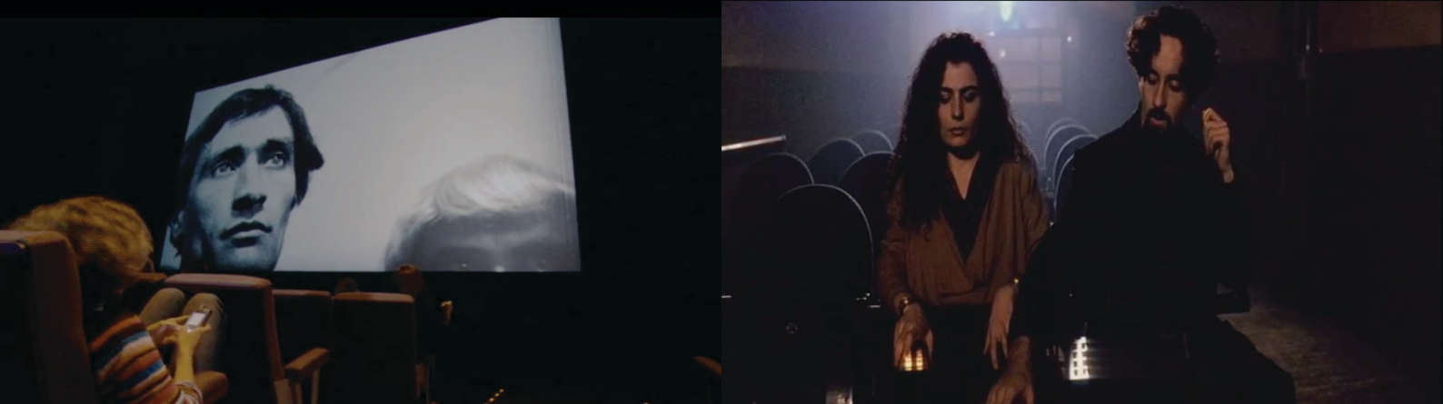
Atom Egoyan's Artaud Double Bill (2007)