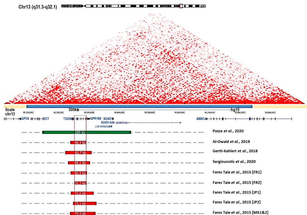
Figure 3. Summary of 13q32.1 structural variations associated with congenital microcornea. The two-dimensional heat map representing normalized Hi-C sequencing visualization in HMEC with the 3D Genome Browser is shown [72]. The topologically associating domain (TAD) encompassing the MCOR region and spanning 600 kb is indicated with a light blue bar (chr13:95,075,000–95,825,000, Hg19 and 5 kb resolution). Gene organization at chromosome 13q32.1, and position and size of structural variations (deletions in red; duplication in green) reported in individuals suffering from congenital microcornea [7,31,32,67]. The critical deletion (shown in red frame) responsible for MCOR spans 31.8 kb (hg19, chr13: 95,241,606–95,273,292). The reciprocal duplication encompasses 7 genes: DCT , TGDS , GPR180 , LOC101927248 , SOX21 , SOX21-AS , and LOC101927284 [12].

children. All were described as having normal chamber angle and early onset myopia [32] or minimal hyperopic astigmatism [67]. The mother in the Saudi family reportedly suffered bilateral senile cataract [67]. All the deletions except the one identified in Mexican families differ from each other, which suggests independent events [7]. Extensive bioinformatic analysis of deletion breakpoints and surrounding genomic architecture has identified a duplicated sequence prone to recurrent nonallelic homologous recombination in one case. The others likely involve nonrecurrent microhomology-mediated rearrangement [7]. Analysis of the positions of the deletions, which range in size from 35 kb to 85 kb, places the critical congenital microcornea-causing deletion in a 31.8 kb interval (Figure 3). Although variable in size, the deletions encompassed or interrupted the tail-to-tail genes TGDS and GPR180 .