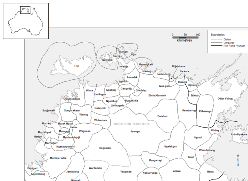
Figure 1. Languages of northern Australia (Harvey 2008).

Anindilyakwa is a Gunwinyguan language spoken on the Groote Eylandt archipelago, east Arnhem Land, Northern Territory (see Figure 1). It is a vibrant language, spoken by over 1400 people and is one of the few Australian languages still being acquired by children. 3