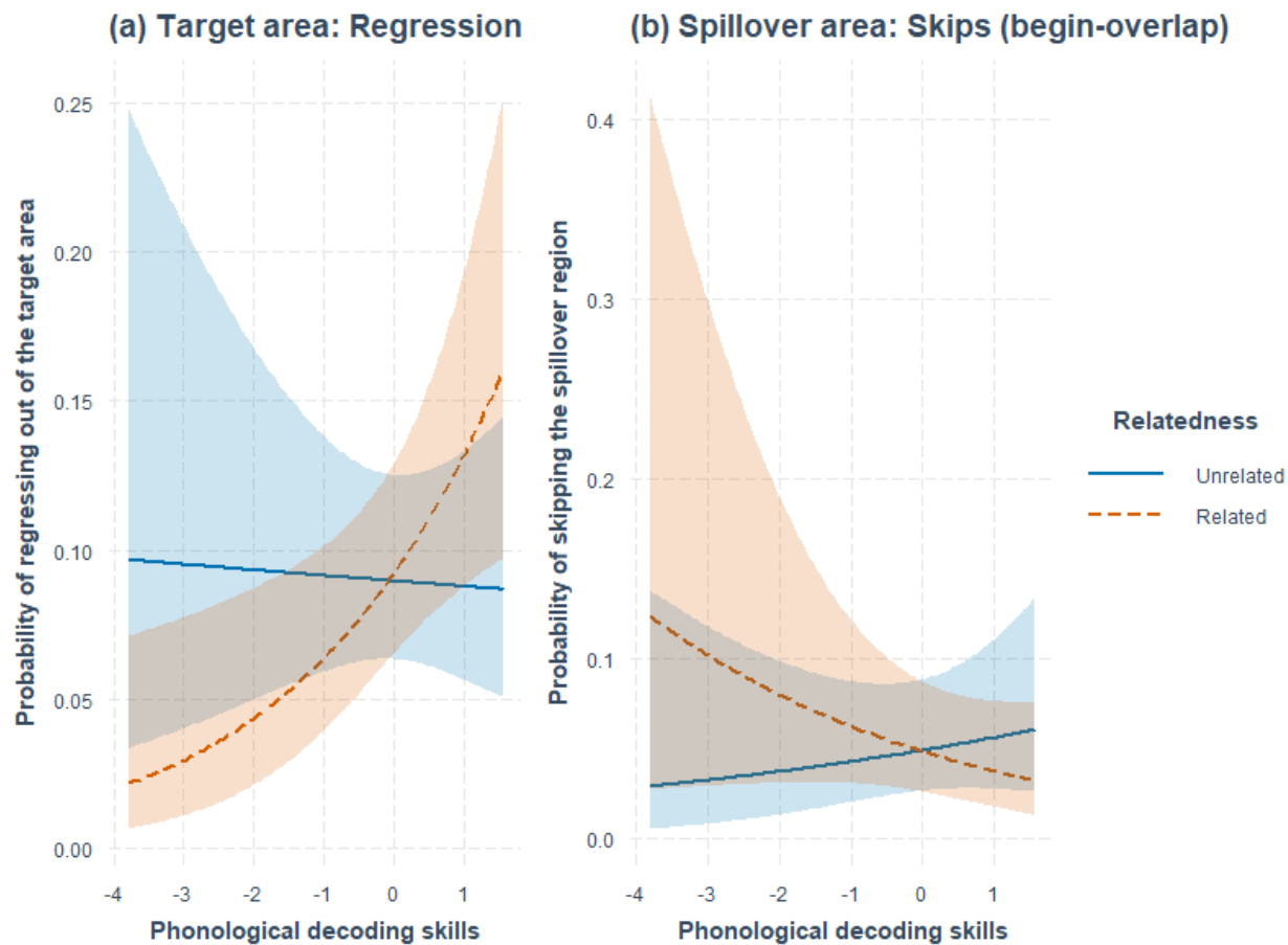
Figure 1. Plots for significant interactions between relatedness and individual difference predictors in the short-distance condition