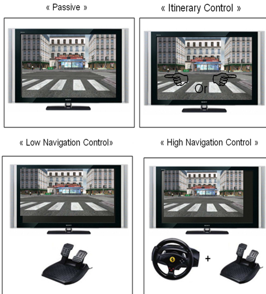
FIGURE 2 | The four experimental conditions assessed during the virtual exploration in the VR-EM test.

of information (“what”). For each image, the participants were shown two snapshots of scenes. They had to decide which of the two displayed scenes was or not in the virtual town. Their response had to be based on the scene, and additionally on elements in the scene and on the spatial location of elements in the scene.