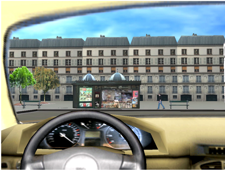
FIGURE 1 | Picture of a specific area of the virtual town (a newsstand, a man and two benches).

The participants were seated in a comfortable chair. The VE was projected 150 cm in front of them.