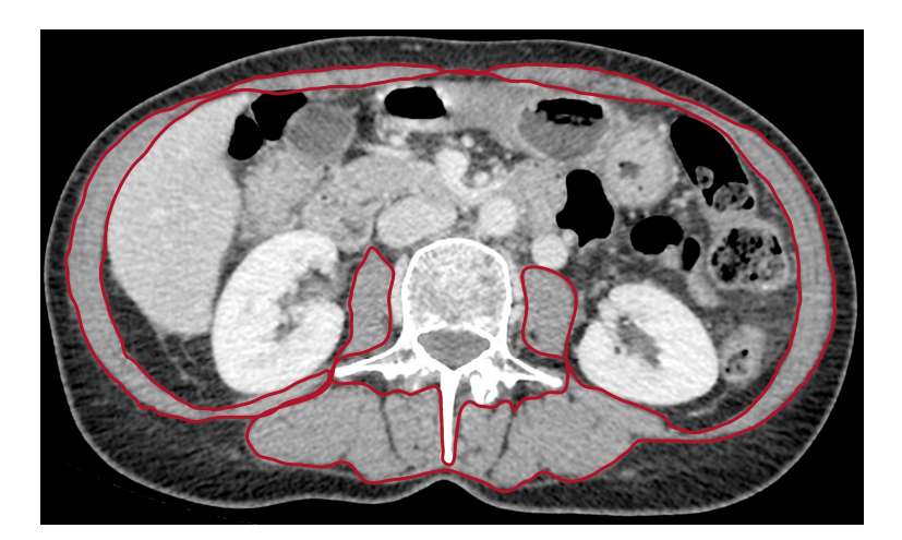
Figure 1. CT image in the axial plane at the level of the third lumbar vertebra in a sarcopenic patient with metastatic pancreatic carcinoma. Regions of interest (ROI) for sarcopenia measurements on axial CT image are indicated inside the red zone.